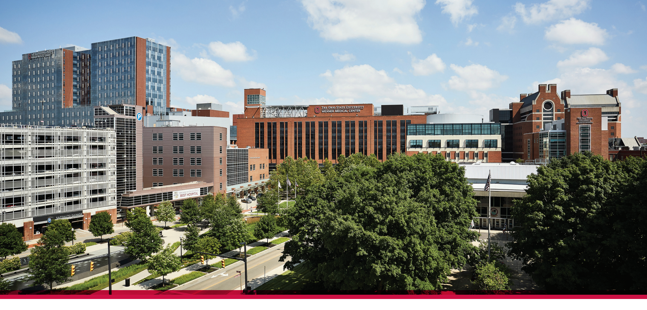
HealthMap 2019 Executive Summary