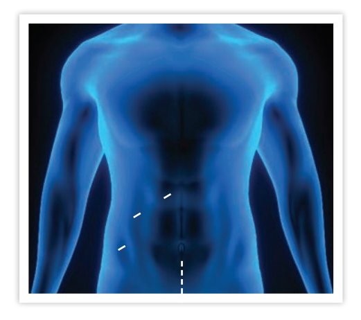
Incision for right kidney donation

After surgery, you will be moved to the transplant unit for private recovery. While in your room, you will be closely monitored by our transplant team to ensure you are recovering well, have limited nausea, are able to eat, use the bathroom and pass gas, and are free from infection. Ask us for help when you want to get out of bed, as the surgery and medicines you are given can make you feel less than steady on your feet.