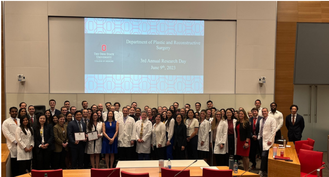
2023 Research Day