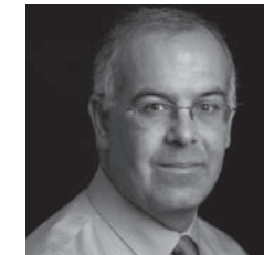
David Brooks Social Commentator