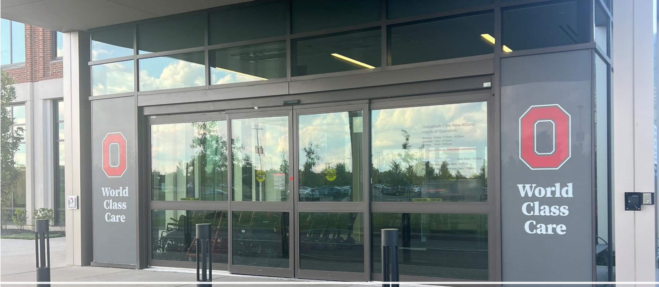
After parking, you will walk through the main doors of Outpatient Care New Albany.