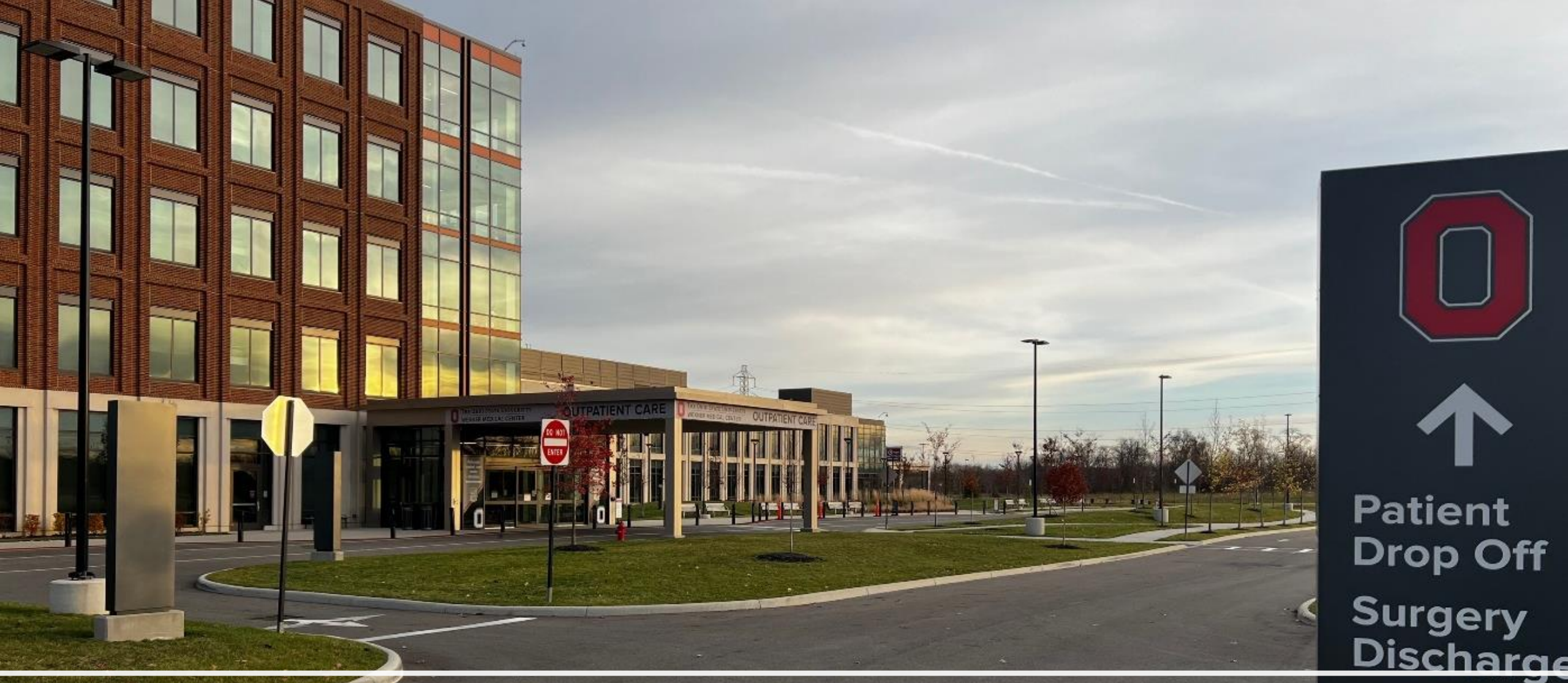
OSU Outpatient Care New Albany offers two types of parking options for patients and visitors. The first is to follow the signs labeled “parking” to park your vehicle in the surface lot.