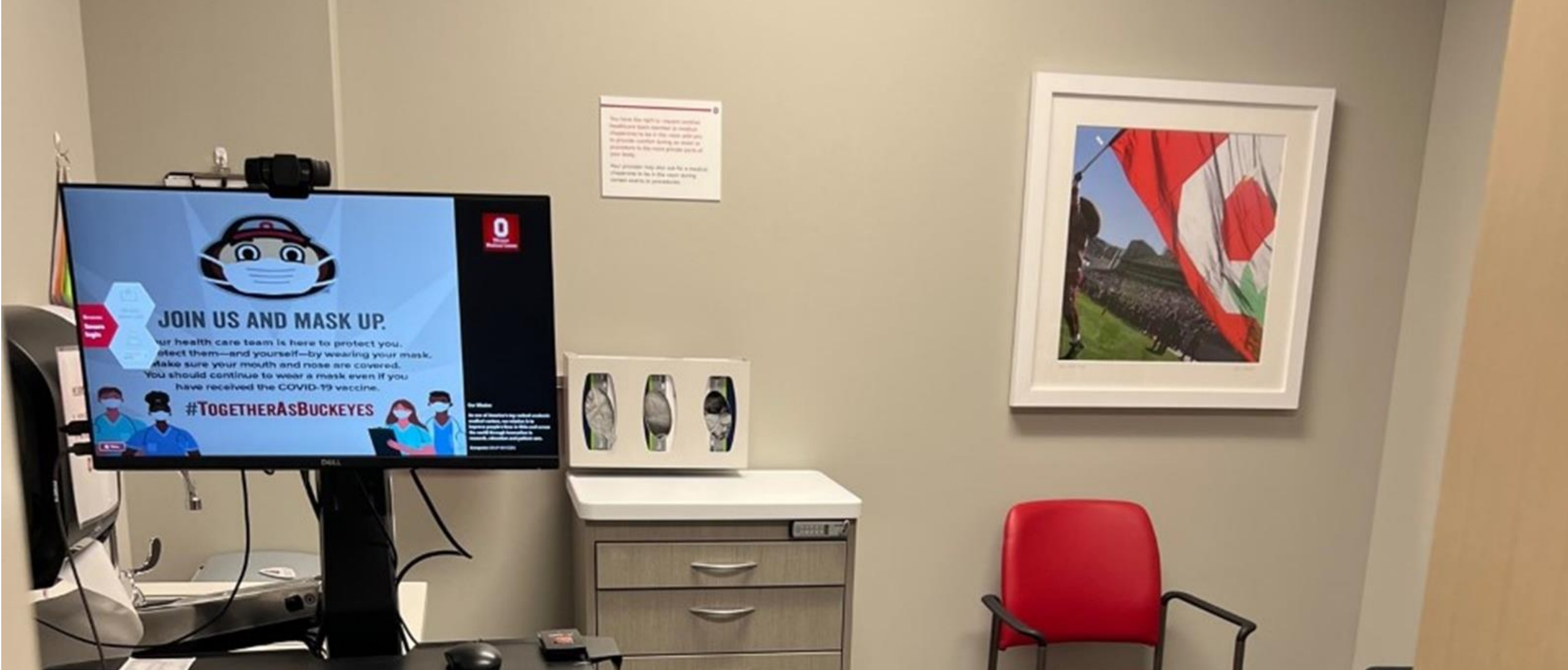
This is a view of the inside of the patient rooms where you will wait for the doctor.